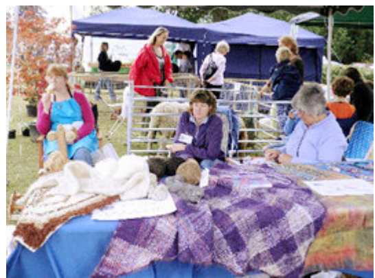
Ockley & Okewoodhill Flower Show