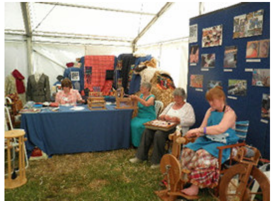
Celebrating Surrey – Loseley Park