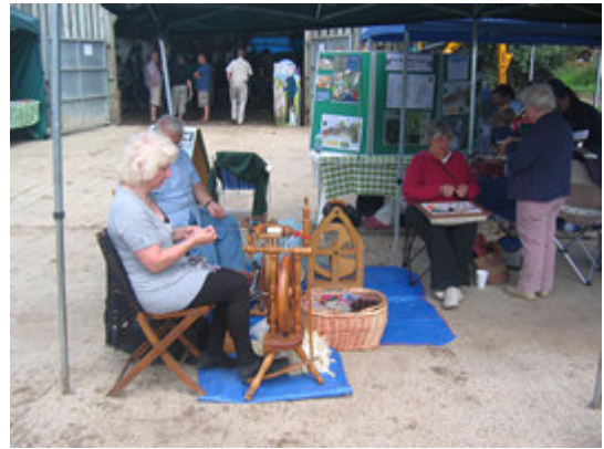
Shabden Park Farm